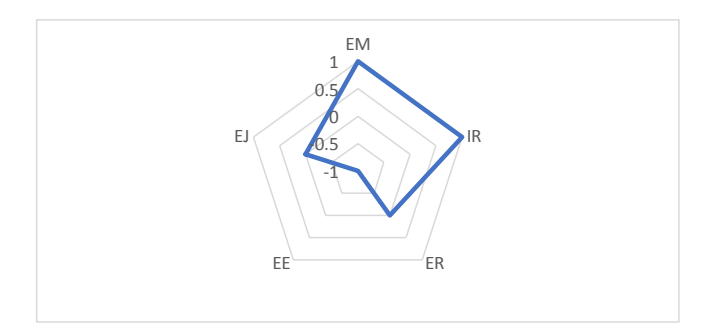
Fig. 1. Area graph representing the impact of five attributes of the Istranca and Konya plain projects in Turkey.

Assume N sustainability attributes that can be identified in relation to the intra- or inter-basin transfer. Some of these sustainability attributes could remain neutral as a result of the transfer, some could be affected negatively, and some could be affected positively. In each particular reported transfer study we could identify effects on all or a